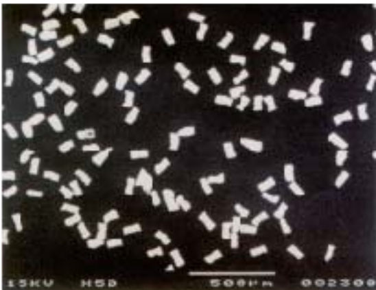
Cross section photo of the fibers